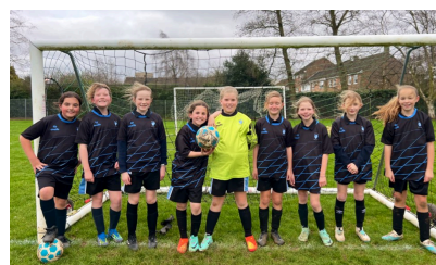
Year 5 & 6 girls football