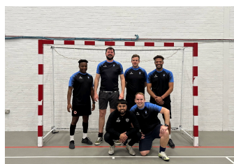
Staff Football Team

Congratulations to our Sports Legends this week. Please see this weekend's X (twitter) and Facebook posts for details celebrating these achievements.