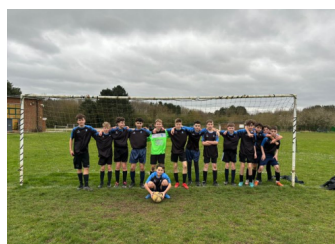
Year 9 Football

It has been another busy week for fixtures at home and away. Please click on the links below the images to view the EtonburyPE X posts where we share all our team news and celebrations.