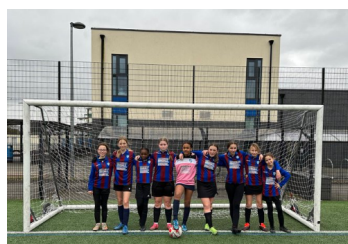
Year 7 & 8 Football