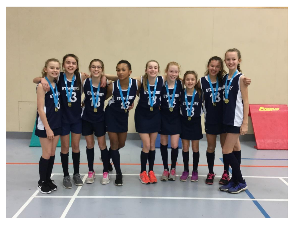
Year 7 Girls Indoor Athletics - District Champions and County Champions

Year 5 Netball team - District Champions and 4th in County finals Year 7 Netball team - District Champions and 4th in County finals KS2 Girls Football - District Champions and awaiting County finals KS2 Girls - First in Cross Country Relays